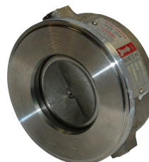
Model 1603 Front

Mueller Steam Specialty product specifications in U.S. customary units and metric are approximate and are provided for reference only. For precise measurements, please contact Mueller Steam Specialty Technical Service. Mueller Steam Specialty reserves the right to change or modify product design, construction, specifications, or materials without prior notice and without incurring any obligation to make such changes and modifications on Mueller Steam Specialty products previously or subsequently sold.